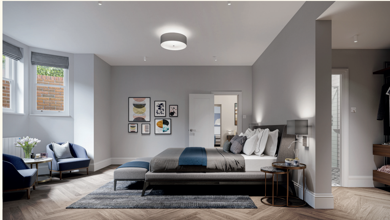
Bedroom in unit 1