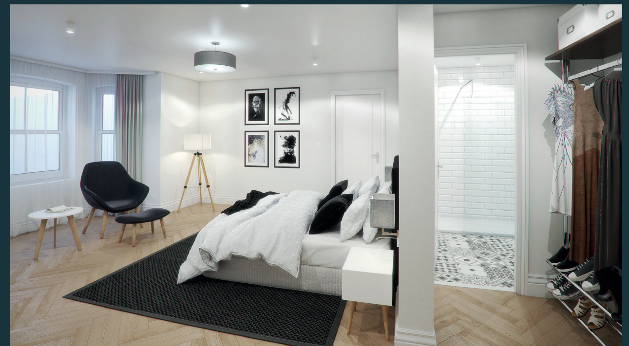
Bedroom in unit 1

Frosted glass balustrade around perimeter Wood-effect acrylic anti-slip flooring