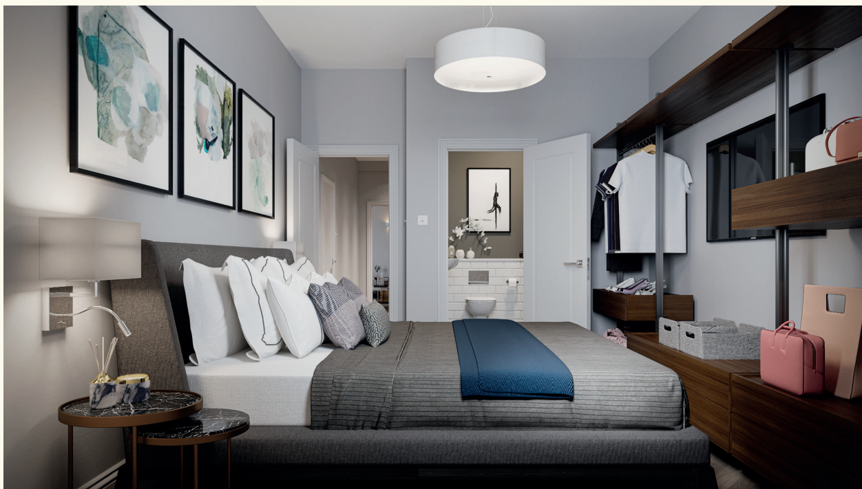
Master bedroom in unit 4