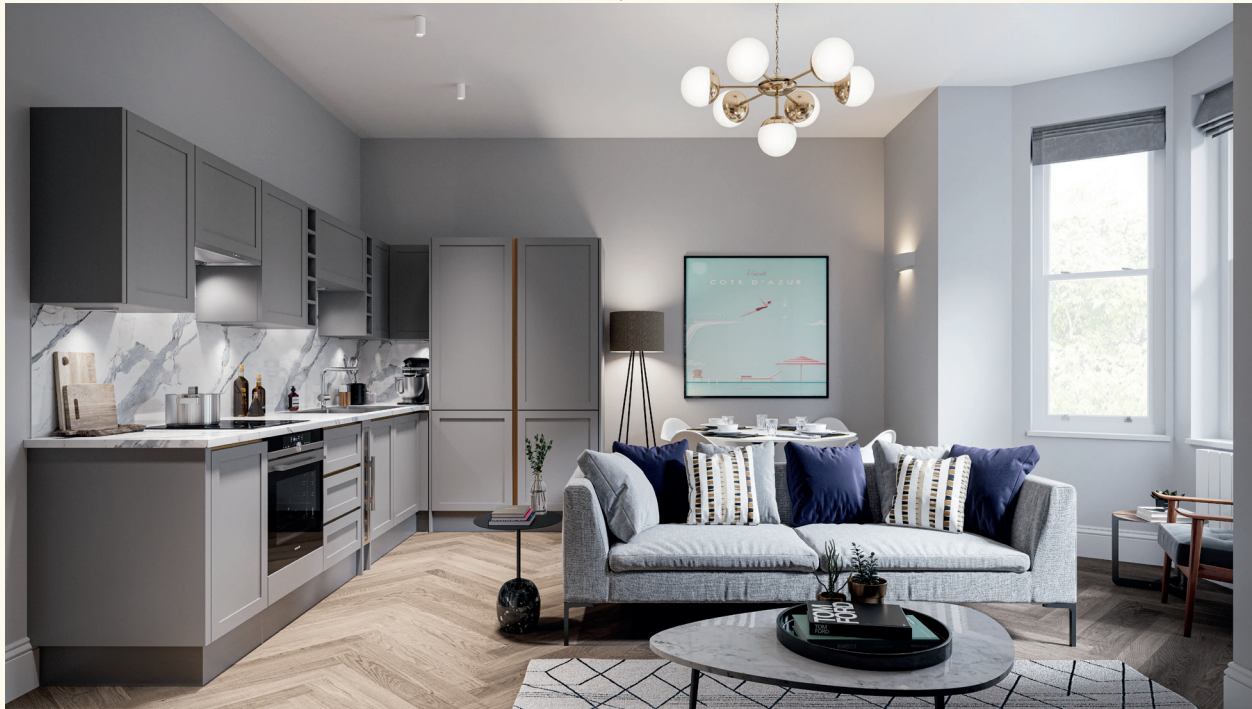
Living room in unit 3