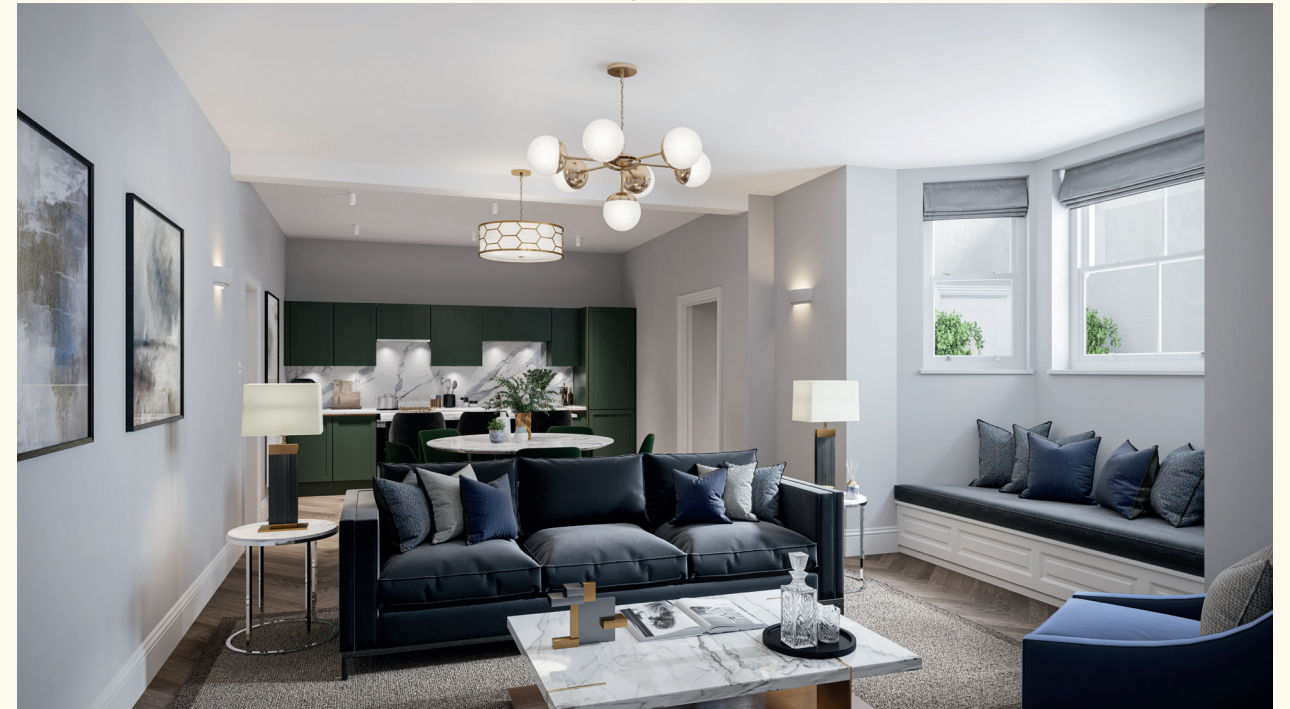
Living room in unit 1