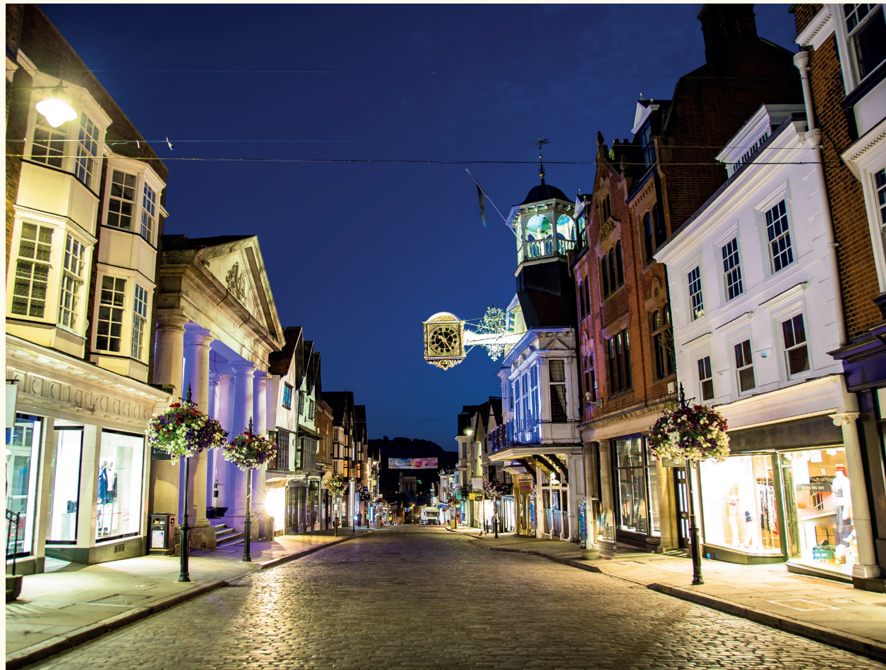
Guildford High Street

The extensive selection of eateries throughout Guildford means there is something here for everyone; sample some exotic Mediterranean cuisine at Blue Sardinia, try some new Asian delights at the top-rated Maloncho Tandoori Indian restaurant or perhaps the traditional English grub with a luxury twist at the Onslow Arms gastro-pub is more up your street.