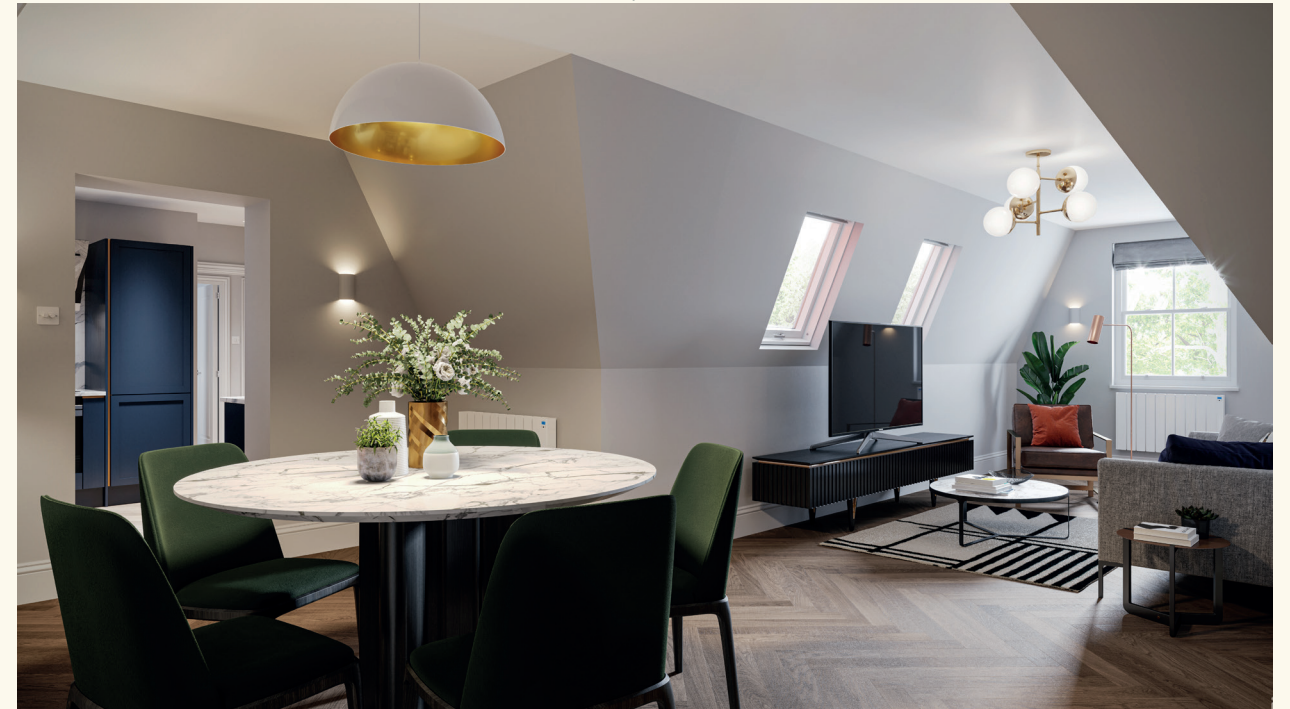
Living room in unit 6