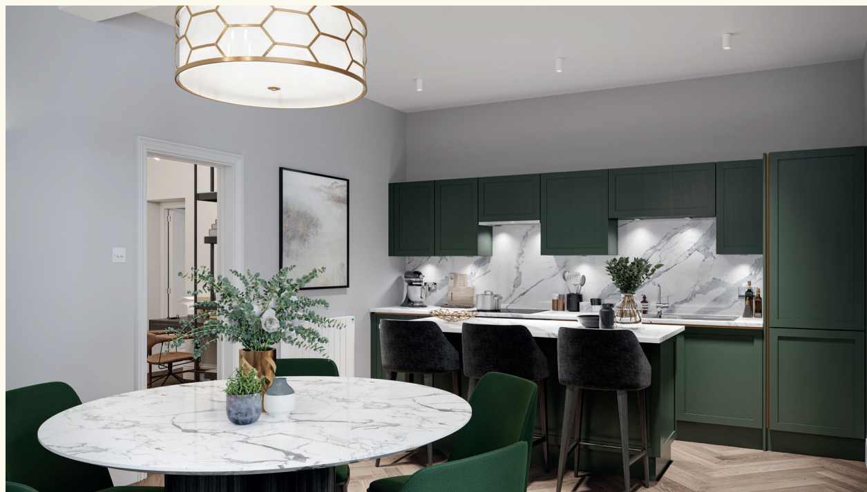
Kitchen in unit 1