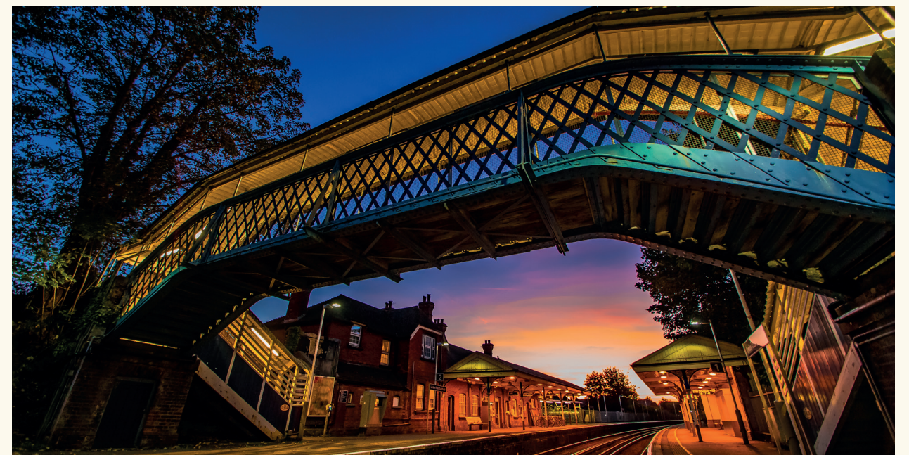
Guildford London Road station