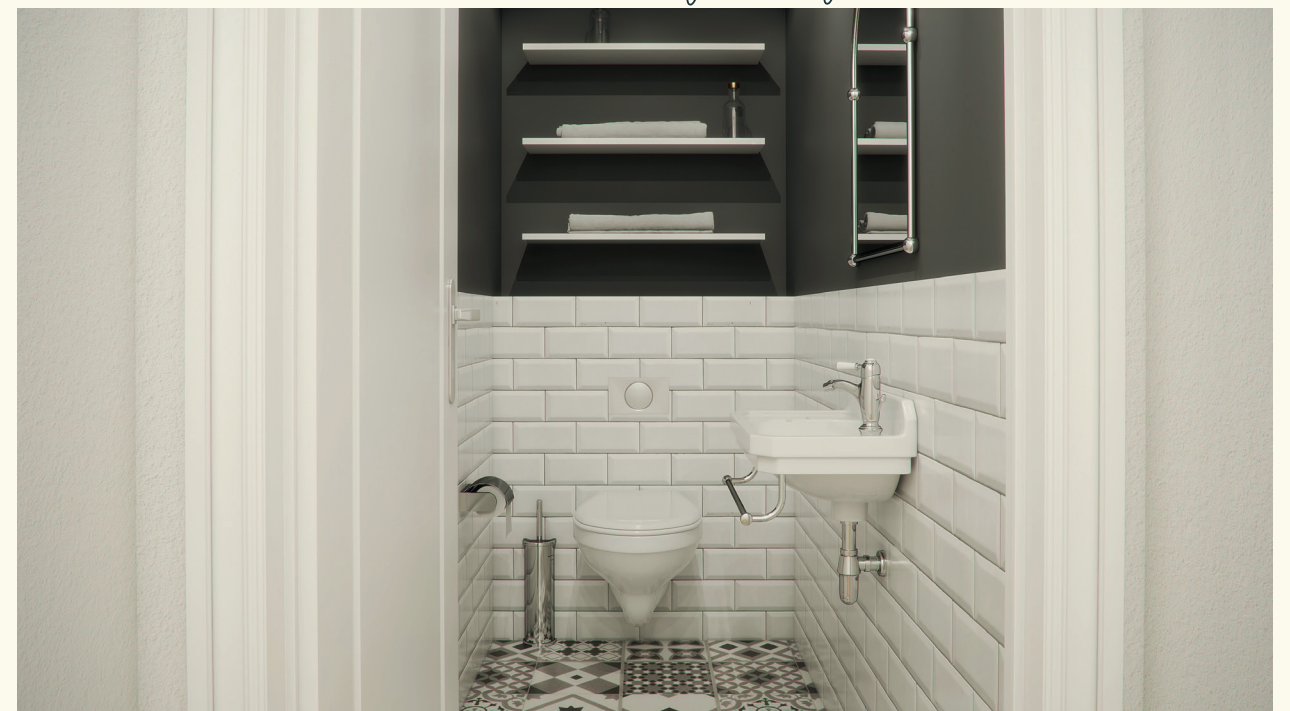
Cloakroom in unit 1