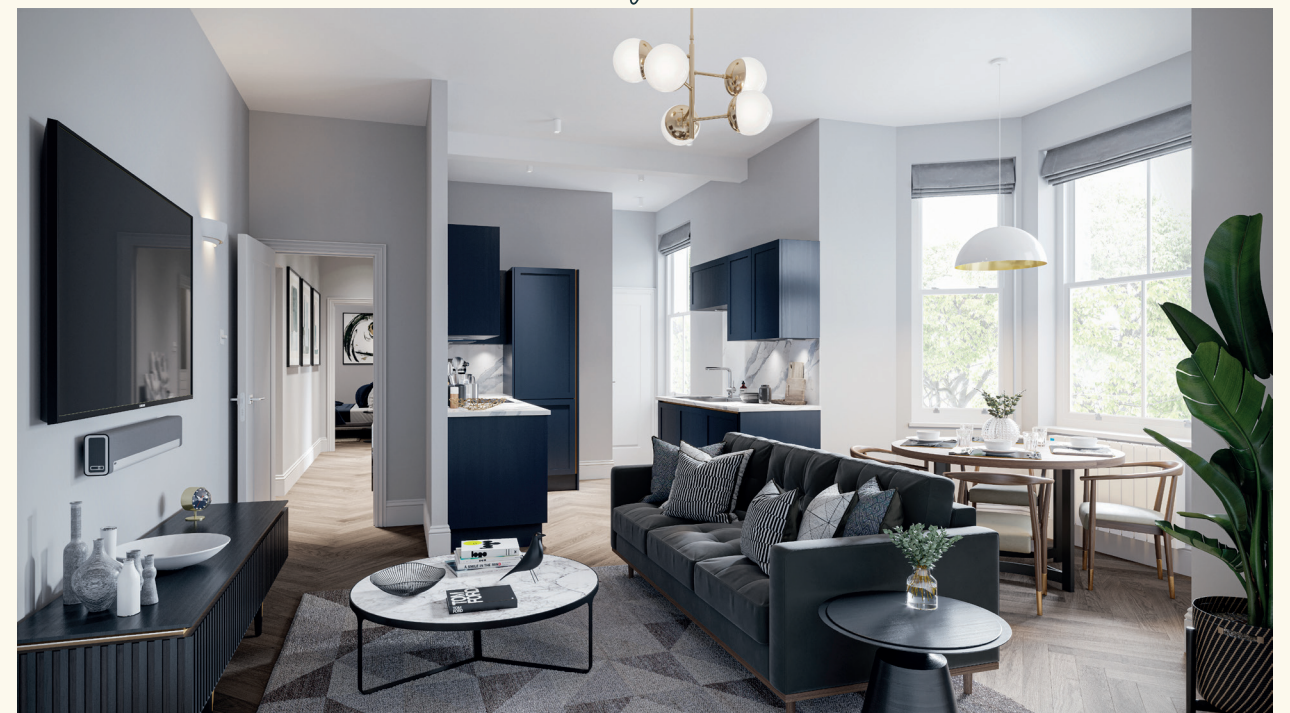
Living room in unit 2