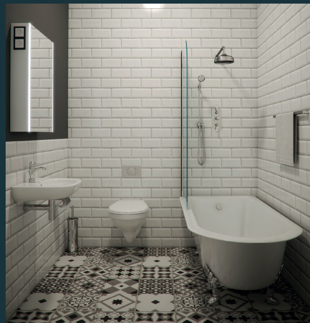
Bathroom in units 4 & 6

Wi-Fi radiators Bespoke statement lighting: Dar Bombazine 5-light ceiling pendant natural brass (units 2, 3, 4, 5 & 6) Bespoke statement lighting: Bombazine 7 arm ceiling pendant natural brass (unit 1 living area) Dining table pendants: Rondure white and gold (units 2, 4 & 6) Dar Epstein ceiling pendant light – gold for dining area to unit 1 Wall lights: Kyo ceramic wall light Vivian ceiling pendent to bedrooms Bedside lights: Hotel wall light with LED reading stick Unit 1 office: Rod 15 arm led ceiling pendant lighting White stone plug sockets and switches